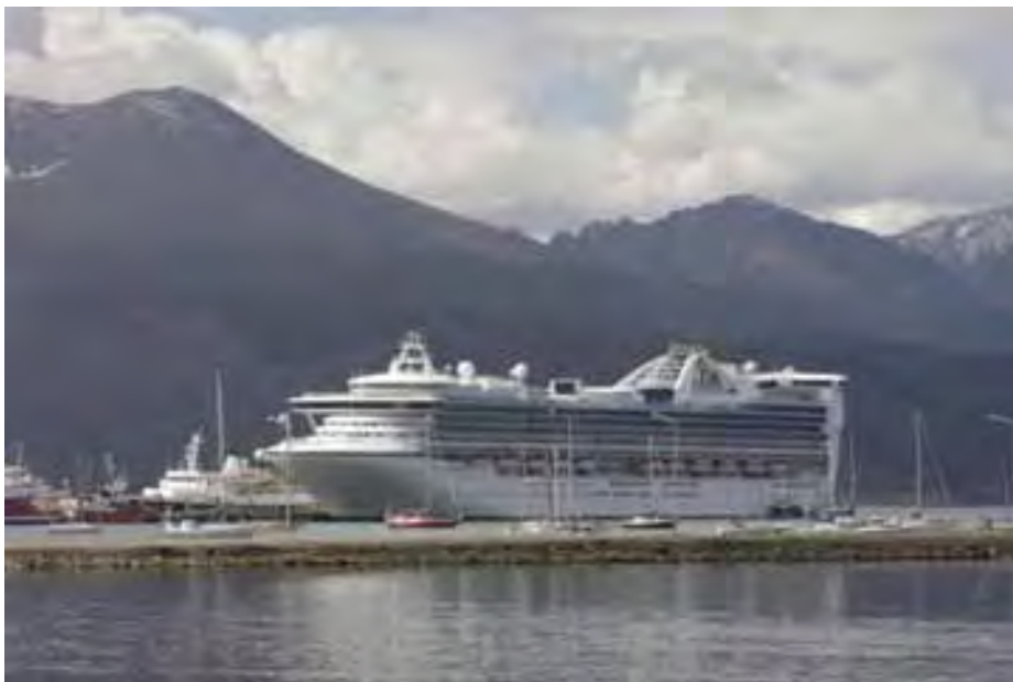
The Star Princess in Punta Arenas

The next morning after a walk in the local park which produced Picazuro Pigeon, Rufous-bellied Thrush, Chalk-browed Mockingbird and Shiny Cowbird and the inevitable Rufous-collared Sparrow. Later this morning we were taken by bus to the docks and eventually boarded our five star luxury accommodation which was going to be our home for the next 16 nights.