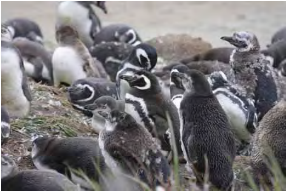
Magellanic Penguins at Gypsy Cove

A great day and although windy, the weather by their standards had been extremely kind to us. I would like to have spent a few days on the islands but on this occasion this was not possible.