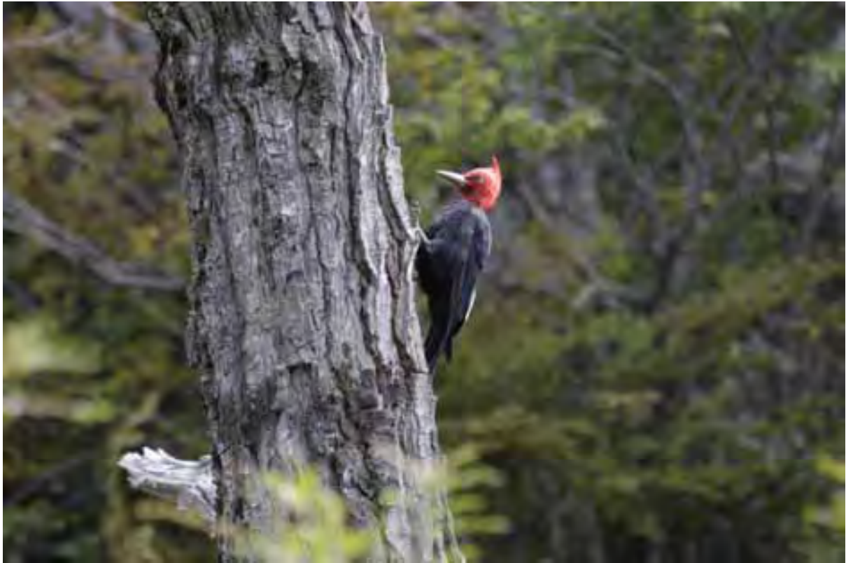
Male Magellanic Woodpecker

A trip to the local rubbish tip resulted in Chilean Skua and the sought after White-throated Caracara.