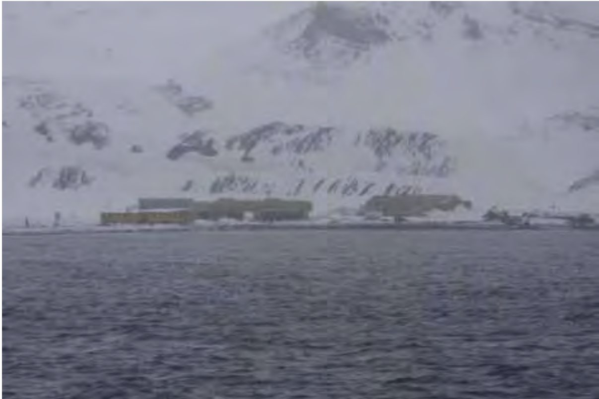
Polish Research Station

mantled Sooty Albatross was seen from the restaurant in the late afternoon