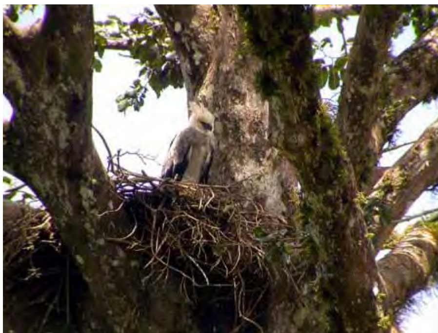
Immature Harpy Eagle at a nest

Eastern Venezuela provides a constant parade of birding spectacles. Starting in the Imataca forest reserve at Rio Grande we are focused on seeing the magnificent Harpy Eagle .