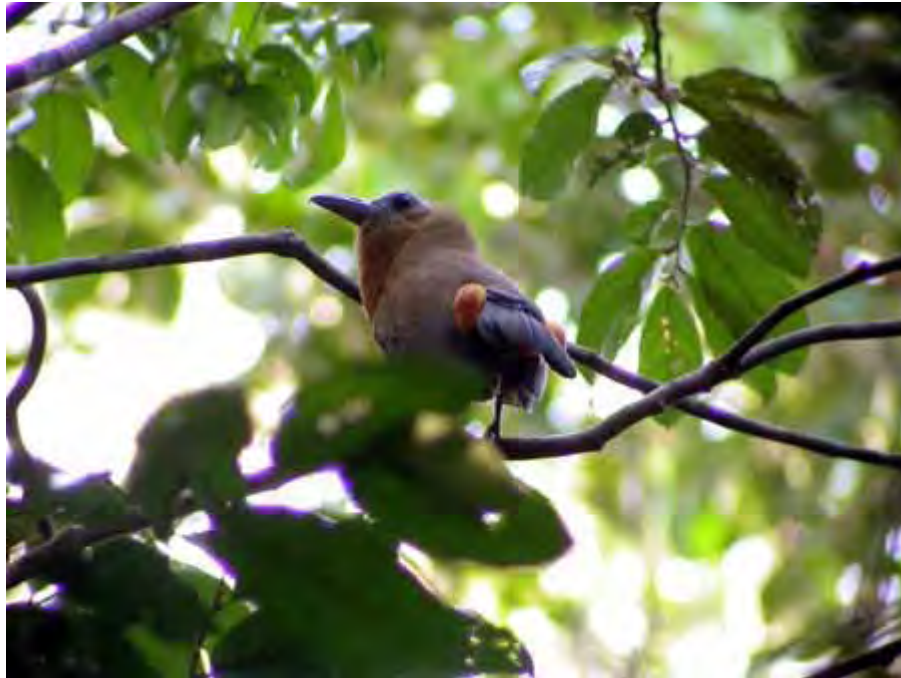
Capuchinbird at lek

In the same area we found a large antswarm flock in 2002 which included a Red-billed Woodcreeper as well as numerous White-plumed Antbirds, Rufous-throated Antbirds and Black-banded Woodcreepers. The Red-billed Woodcreeper is recorded from this site fairly regularly but it is a rare bird and very poorly known. The area is generally good for birds and on both trips we have found Crimson Topaz , Black-faced Hawk , Marail Guan and a good variety of Antbirds. In the evening we give time to searching for Blue-cheeked Amazon and Caica Parrot both of which can be very difficult to see well. In both years we managed to see the rare Blue-cheeked Amazon very well.