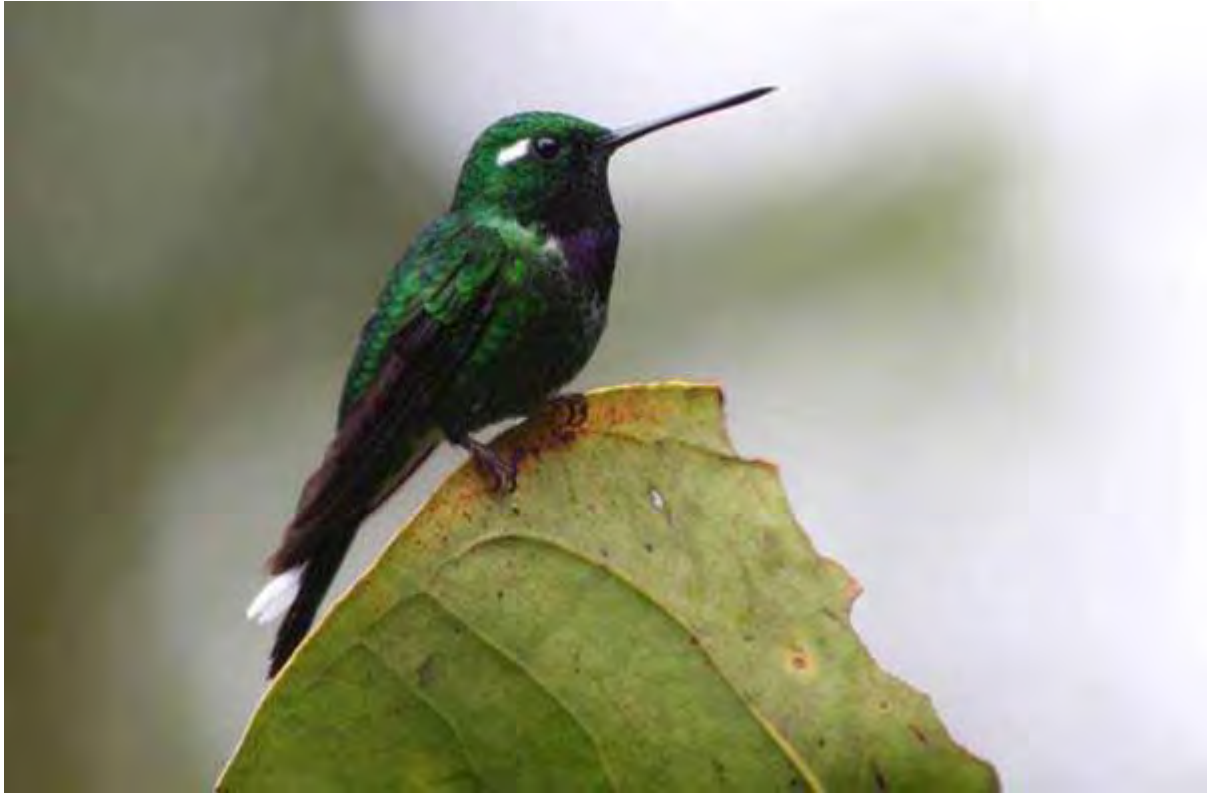
Purple-bibbed Whitetip (Terry Laws)

Western Emerald ( Chlorostilbon melanorhynchus ) 1 seen below Bellavista. Rufous-tailed Hummingbird ( Amazilia tzacatl ) Abundant west flank sites. Andean Emerald ( Amazilia franciae ) Abundant on west flank sites. Glittering-throated Emerald ( Amazilia fimbriata ) 1 Sani lodge. Speckled Hummingbird ( Adelomyia melanogenys ) Common at Bellavista. Purple-bibbed Whitetip ( Urostictae benjamini ) Common at feeders on west flank.