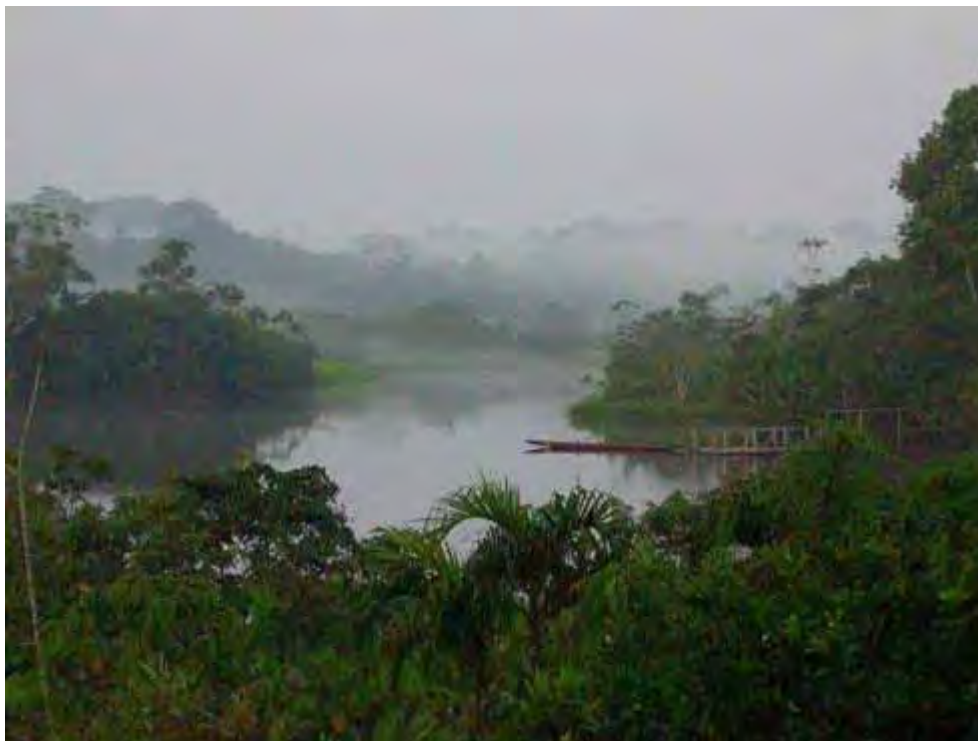
The view from the dining room at Sani Lodge

The following morning we had a relaxed breakfast before taking our boat back to Coca for our flight to Quito. It was delayed owing to bad weather having forced the closure of Quito airport. We were only delayed a couple of hours and we duly flew to Quito. As it turned out we were again extremely lucky as the airport was shortly afterwards closed again for inward domestic flights. It was raining hard in Quito and we were unable to do any more birding. The situation for much of western and upland Ecuador was reaching a critical state with flooding of towns, roads, farmlands and widespread landslides. We were to leave Ecuador in a state of environmental crisis although having enjoyed a great trip and seen many fantastic birds. Although, somewhat restricted in what we could do on the west flank by the weather it seemed the weather to follow us during the rest of the trip.