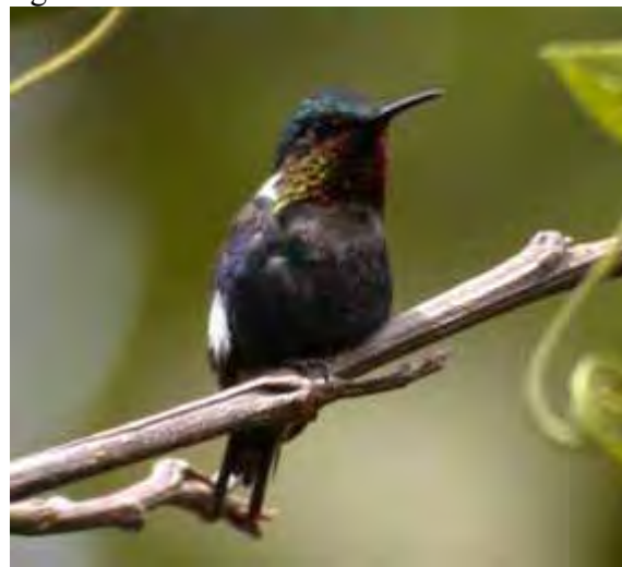
Gorgeted Woodstar (Jeff Larkin)

After some early morning birding we descended to Guango to watch the hummingbird feeders. We were treated to extraordinary views of Sword-billed Hummingbirds together with Glowing Puffleg , Buff-winged Starfrontlet and good numbers of Chestnut-breasted Coronets and Mountain Velvetbreasts. On the river below the lodge we found a small family part of Torrent Ducks and a Black Phoebe. We then spent some time watching and looking through the White-bellied Woodstars until we connected with the rare Gorgeted Woodstar . Having achieved our objective we drove on to San Isidro and in the late afternoon walked the road south of the lodge. This runs through some excellent sub-tropical forests with a dense bamboo under-storey. We saw a couple of emerald Toucanets and a few Tanagers before the light went but it was not raining.