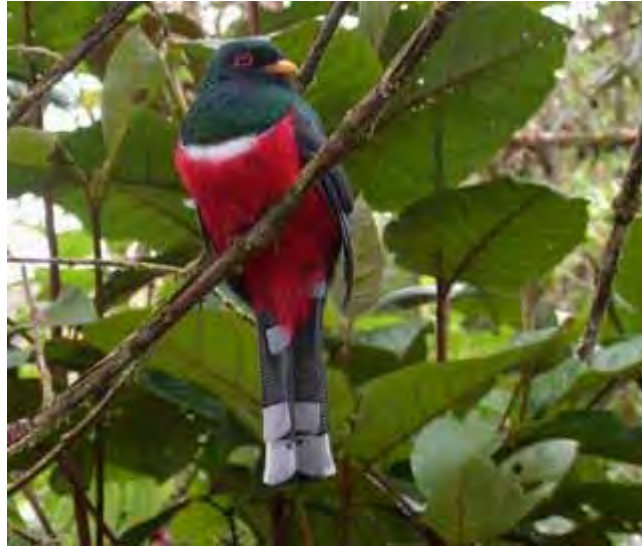
Masked Trogon (Jeff Larkin)

In the morning we made our way through a flooded Quito to the closed airport to sit out the weather. In fact we were only delayed an hour or so and our flight duly delivered us to the rainforests of the Oriente. We then caught our boat down the Napo river for two and half hours to the Sani lodge. The main river channel was very low and the threat of getting stuck very real.