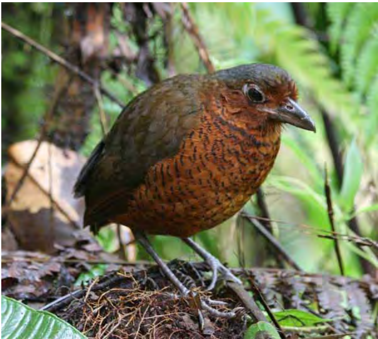
Giant Antpitta (Terry Laws)

The following morning started with clear starry skies and the promise of a beautiful day. In the deep gloom of the pre-dawn we descended through the cloud forests of the Angel Paz reserve to a Cock-of-the-Rock lek. We watched these stunning birds until 7am and also managed to see a pair of Rufous-bellied Nighthawks roosting nearby on a mossy branch. A little later we were treated to point blank views of some rather tame Dark-backed Wood-Quails being fed by Angel. This species is rather localised and very infrequently seen except at this extraordinary reserve. We then got down to the serious business of looking for Antpittas. These elusive birds are also fed at the reserve and may be seen rather more easily here than elsewhere with or without tape. However, we were only to see the Giant Antpitta named Maria by Angel. The other birds were either busy elsewhere or not particularly hungry on this morning. Nevertheless we were treated to spectacular views of this beautiful bird at our feet; a spectacle not to be missed.