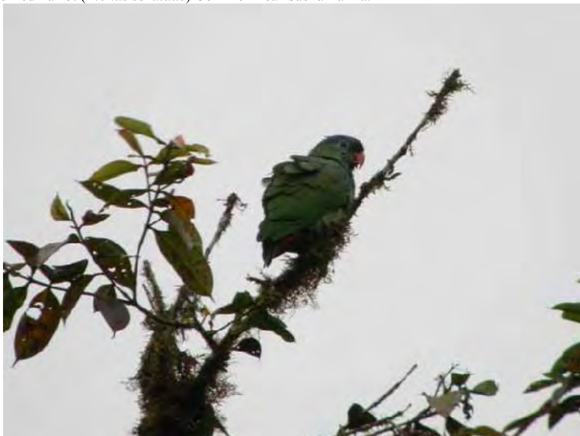
Red-billed Parrot (Eustace Barnes)

Red-billed Parrot ( Pionus sordidus ) Common near Sacha Tamia.