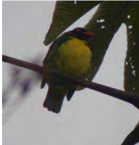
Black-chested Fruiteater (Jeff Larkin)

managed to see a male Chestnut-breasted Chlorophonia and a pair of Flavescent Flycatchers. At the end of the day we retired for another superb meal at the lodge and some celebratory drinks after a day filled with excellent birds. We then photographed and taped the 'San Isidro' Owl again and got some much better views than the night before.