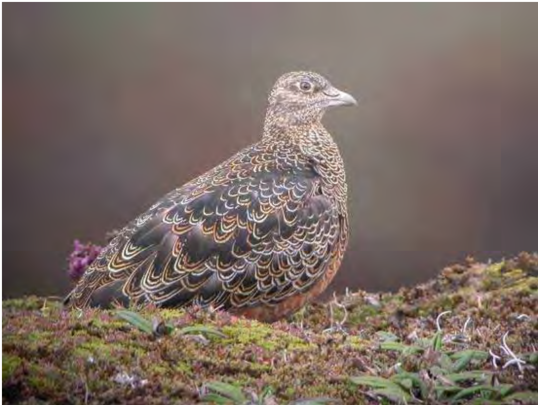
Rufous-bellied Seedsnipe (Eustace Barnes)

of the pass. After a short search we found a pair of very obliging Rufous-bellied Seedsnipe . The birds remained very close, allowing some great photographic opportunities. We then descended to Papallacta to celebrate a successful day at our lodge and enjoy a soak in the thermal's baths.