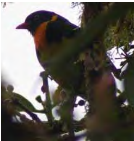
Orange-breasted Fruiteater

After a having had extraordinary views of Giant Antpitta we explored the reserve trails, finding a stunning male Scaled Fruiteater . We then moved on to another site where we saw three Orange-breasted Fruiteaters , including a lovely male. This species is also somewhat localised and uncommon and we were happy to have had such good views of this bird. After this, the fog slowly closed in and it started to lightly rain. We then returned to Sacha Tamia for a last look at the hummingbird feeders and lunch. After lunch we found a number of Toucan Barbets and Lemon-rumped Tanagers around the feeders and we headed up to Bellavista.