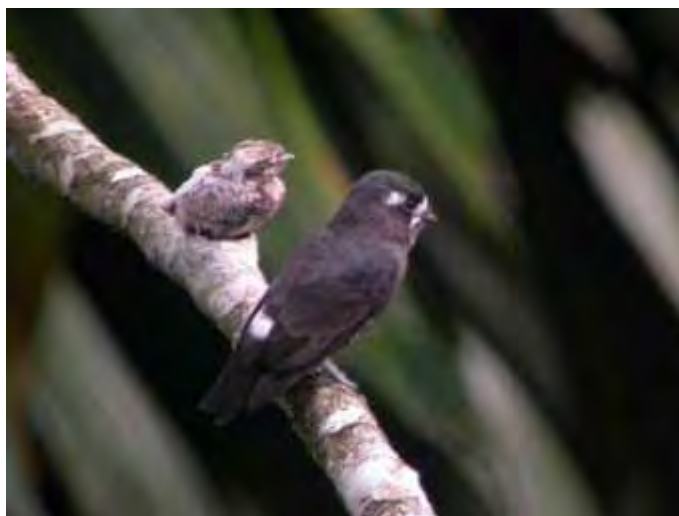
An adult male White-browed Purpletuft at nest, with fledgling. (Eustace Barnes)

canopy tower. We easily saw Many-banded and Ivory-billed Aracari, White-browed Purpletuft and a female Black-bellied Thorntail . The Purpletuft was nesting and we managed to photograph for the first time the second nest ever to be found. We then returned to the lodge for dinner and drink.