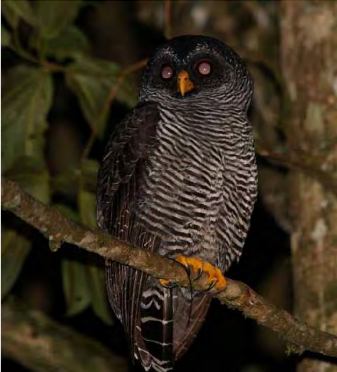
‘San Isidro’ Owl (Terry Laws)

After dinner we saw the ‘ San Isidro ’ Owl just outside the dining area. This stunning bird combines characteristics of both Band-bellied and Black and White Owls. It appears significantly more bi-coloured than Black-banded and seems larger than that species. However, it does have a barred back, scapulars and wings. As is also at a high elevation for both species it may therefore represent a new species, the main problem being that it has not, as yet, been found elsewhere along the east flank and so the question arises as to why an endemic sub-tropical owl should be found only in this part of Ecuador. Until these questions are resolved the identity of this bird remains an enigma.