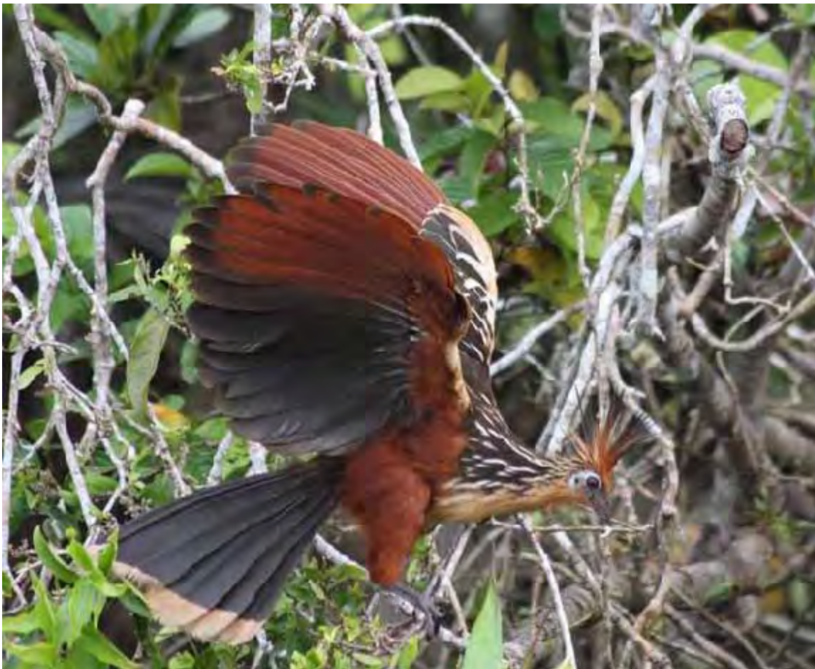
Hoatzin (Terry Laws)

In the morning we made our way through a flooded Quito to the closed airport to sit out the weather. In fact we were only delayed an hour or so and our flight duly delivered us to the rainforests of the Oriente. We then caught our boat down the Napo river for two and half hours to the Sani lodge. The main river channel was very low and the threat of getting stuck very real.