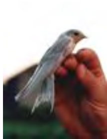
A Diluted Swallow