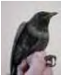
Female Ring Ouzel